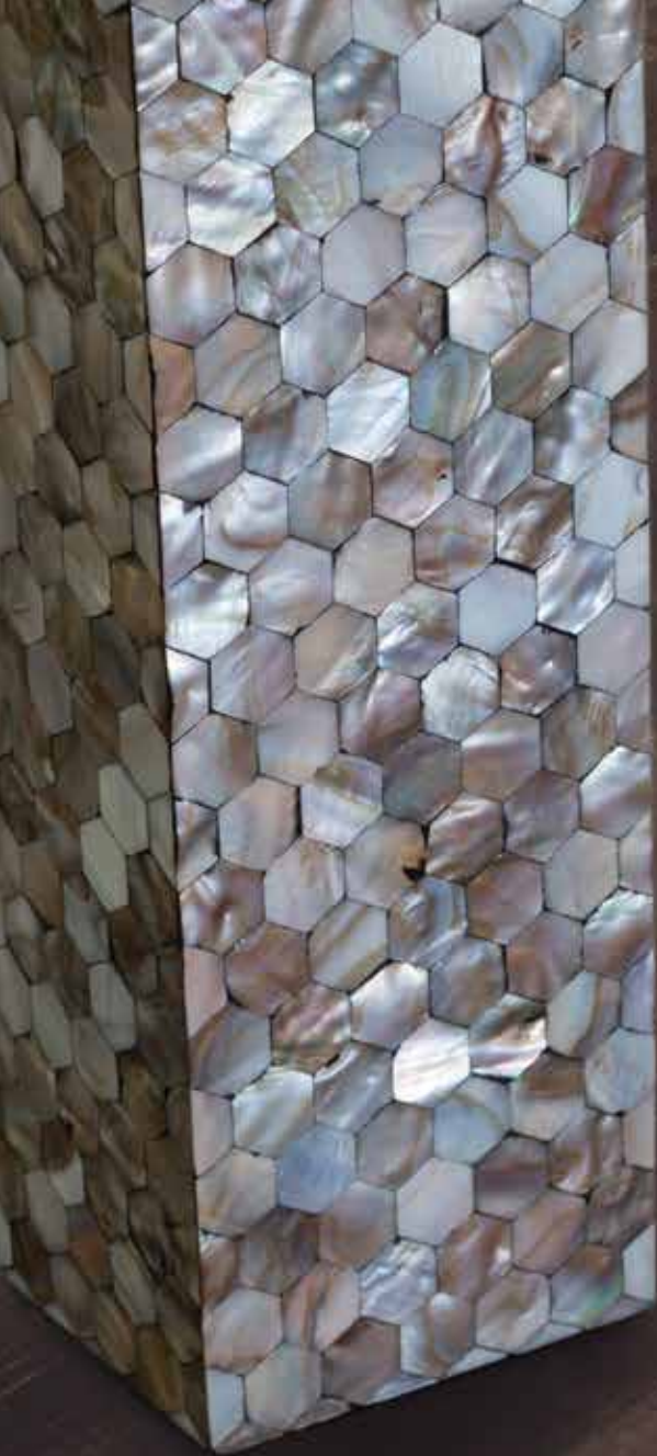
WEATHERED BROWN VDCK-WBRW7