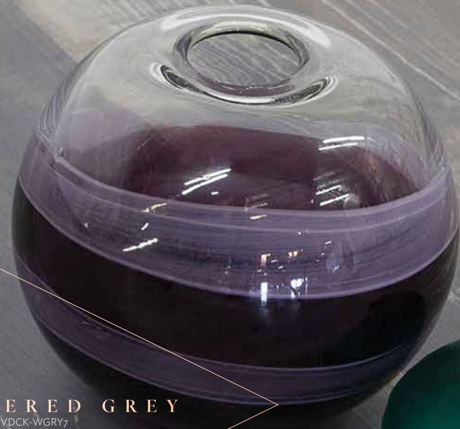
WEATHERED GREY VDCK-WGRY7