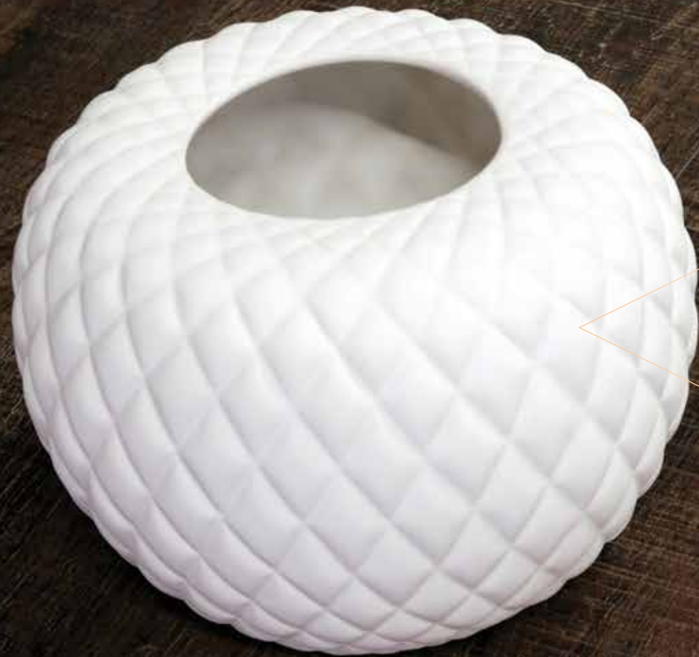
BANDSAWN CASK VDCK-BSC7