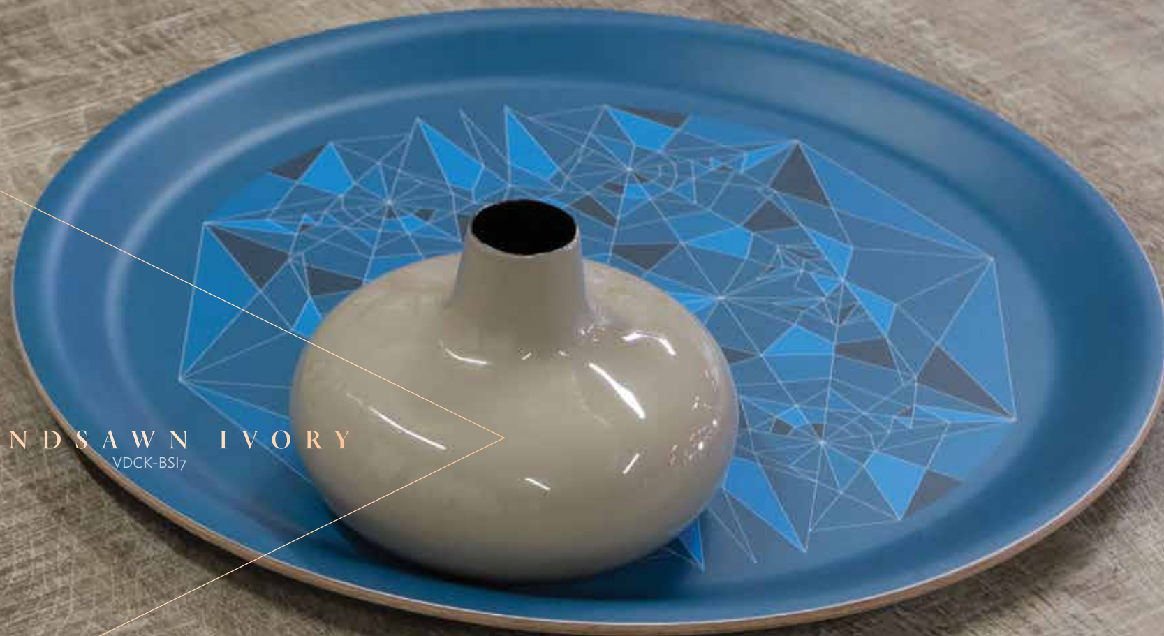
BANDSAWN IVORY VDCK-BSI7