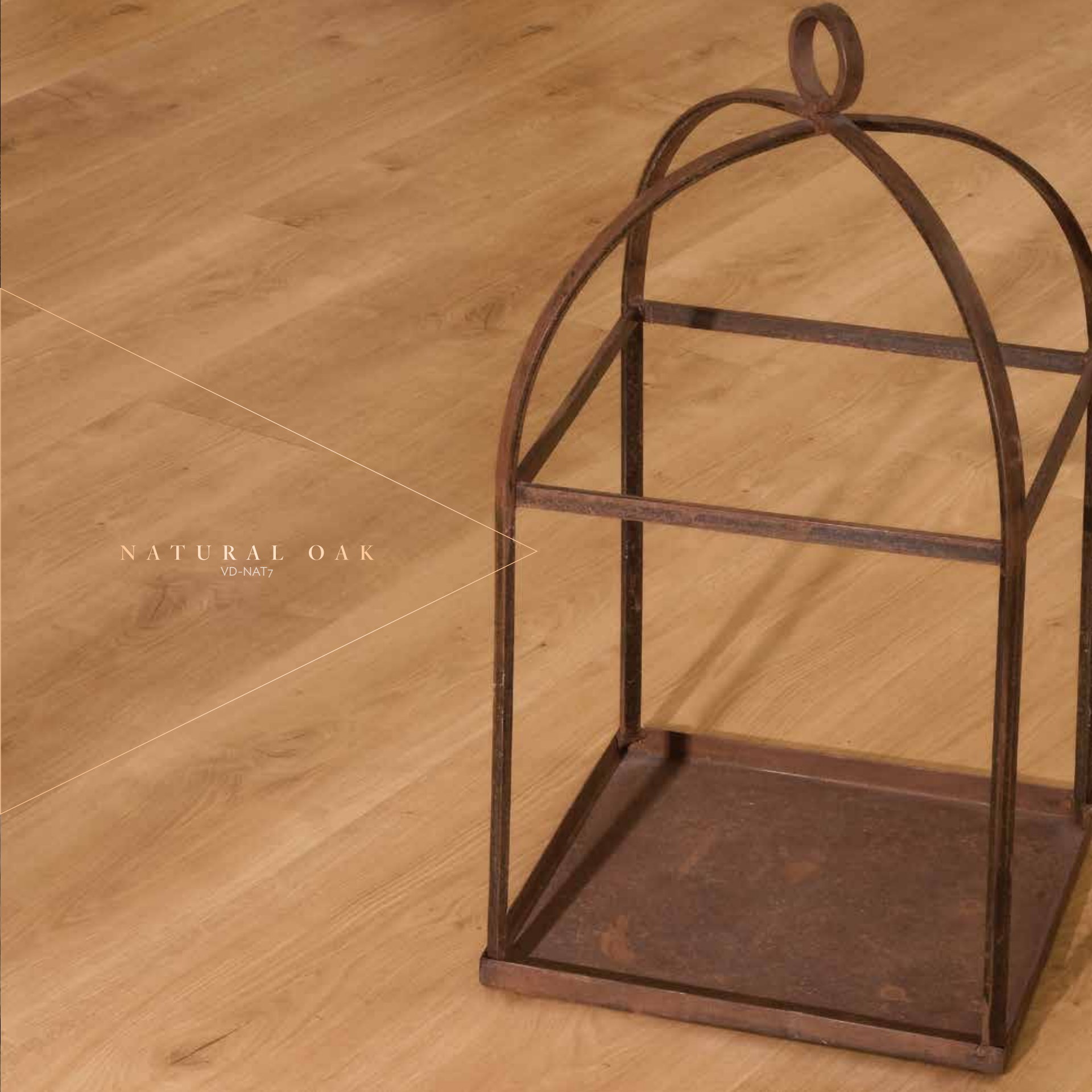
NATURAL OAK VD-NAT7