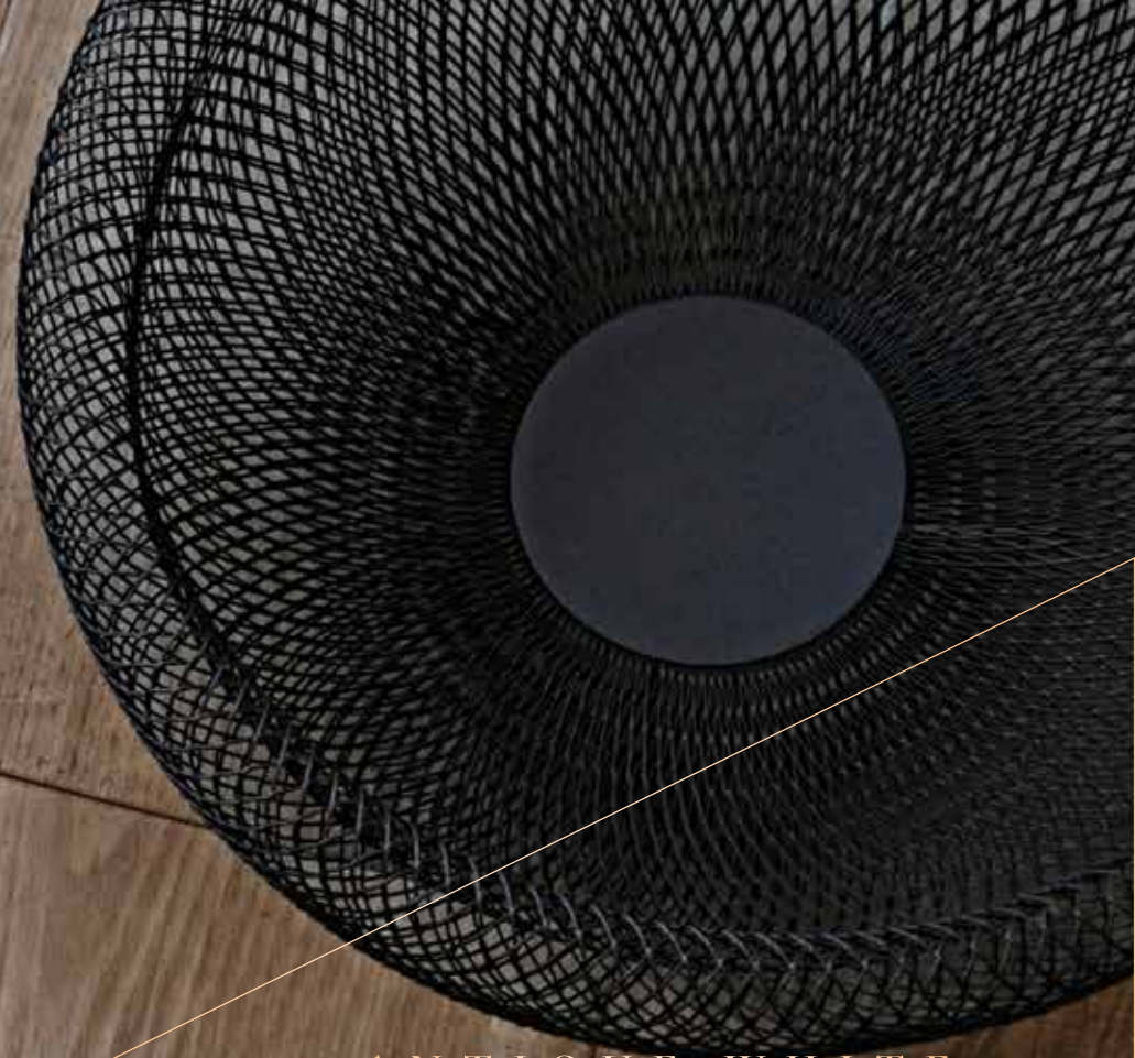
ANTIQUE WHITE VD-AWH7