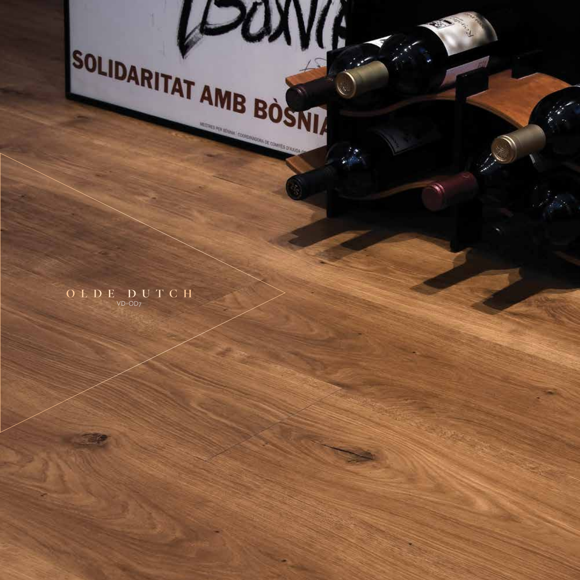
OLDE DUTCH VD-OD7