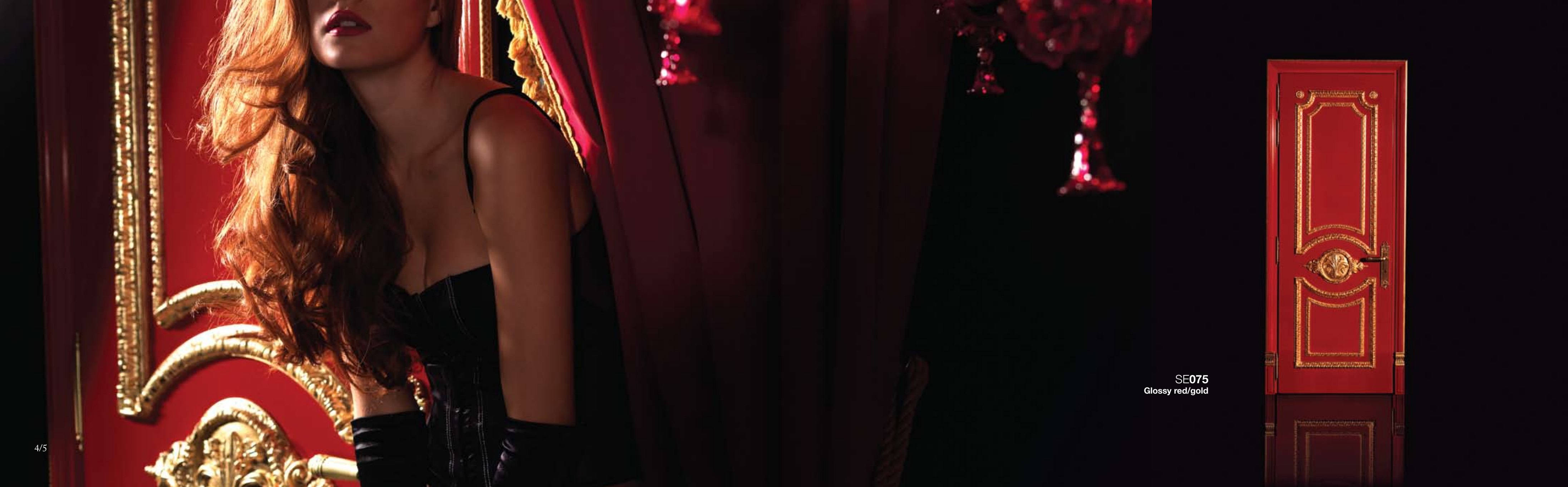
SE075 Glossy red/gold