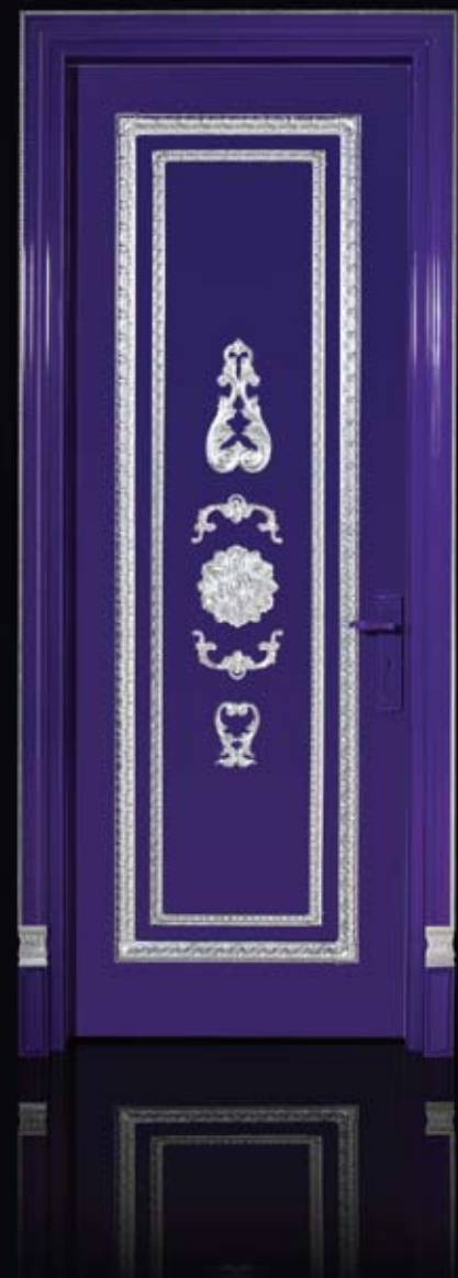
SE110 Glossy velvet/silver