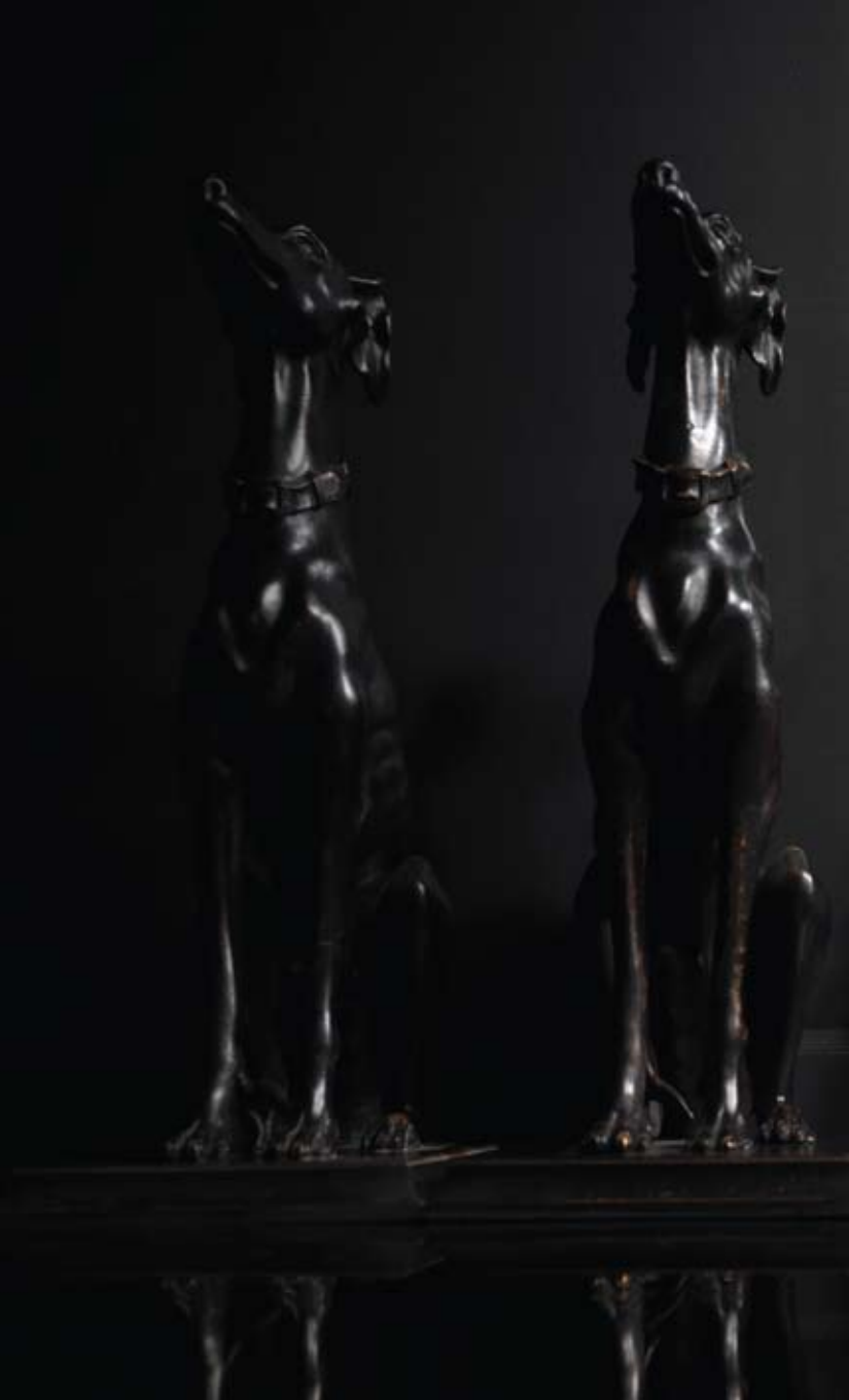
SE075 Glossy black