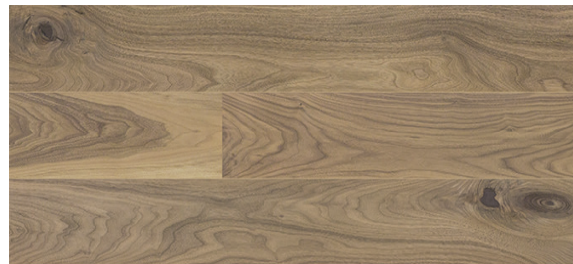
1 Strip US Black Walnut BC 2B Pure Line #5838