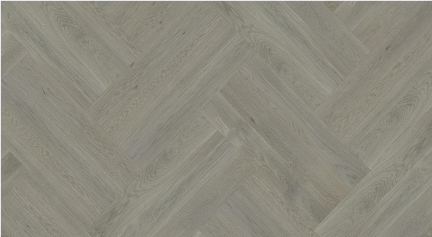
Size Options: 100 x 600 mm 100 x 700 mm 100 x 900 mm 3 lamellas Herringbone Pattern Oak Sandstone Brush 4B