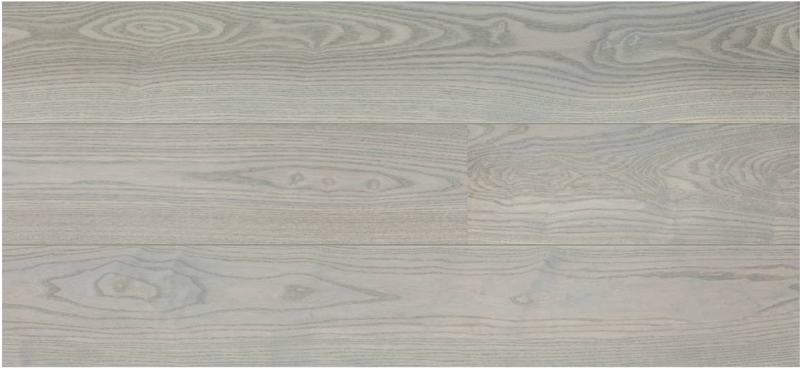
1 Strip Ash Elegant Stone Grey 2B Extra Matt Lac Gloss 5% #3250