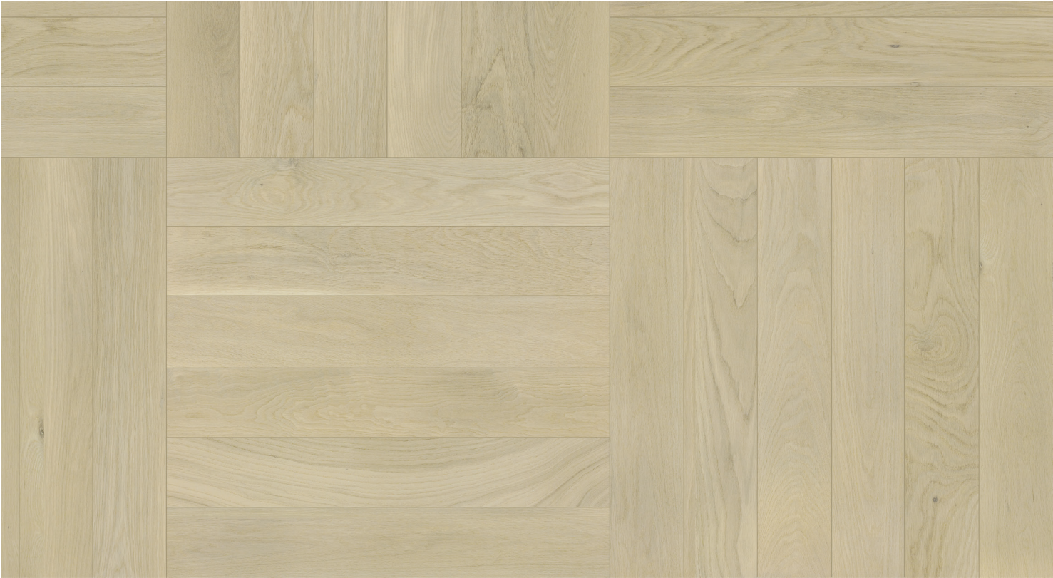
Size Options: 100 x 600 mm 100 x 700 mm 100 x 900 mm Square Pattern Oak London 4B