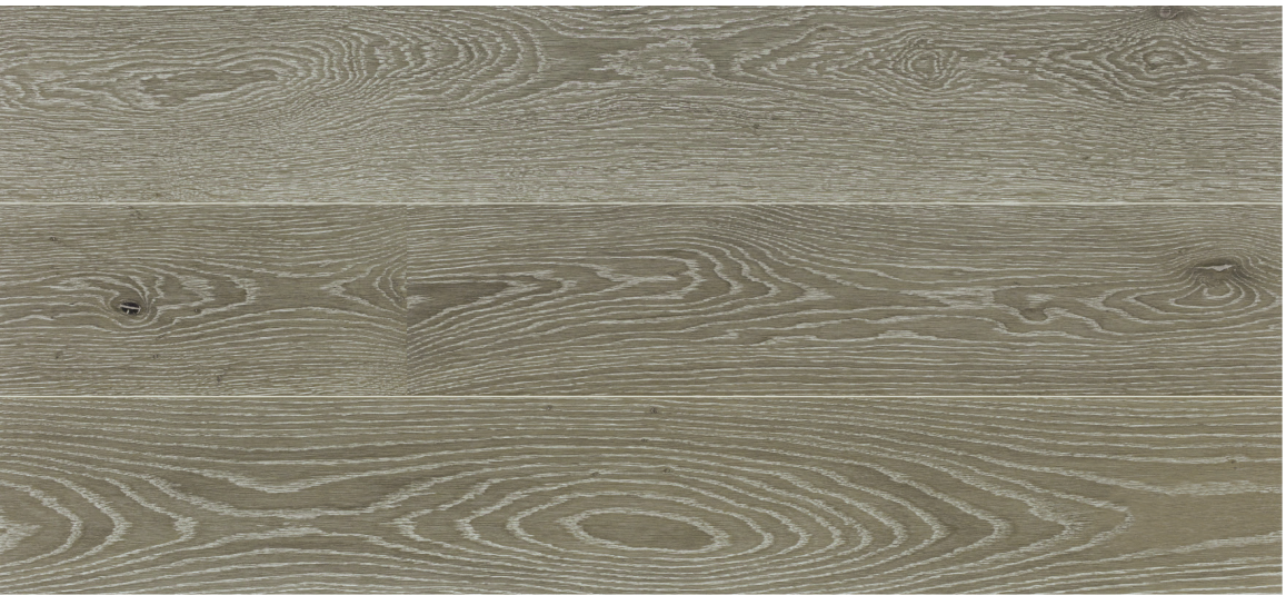
1 Strip Oak AB Olive Grey Ivory Pores 2B Extra Matt Lac Gloss 5% #4061