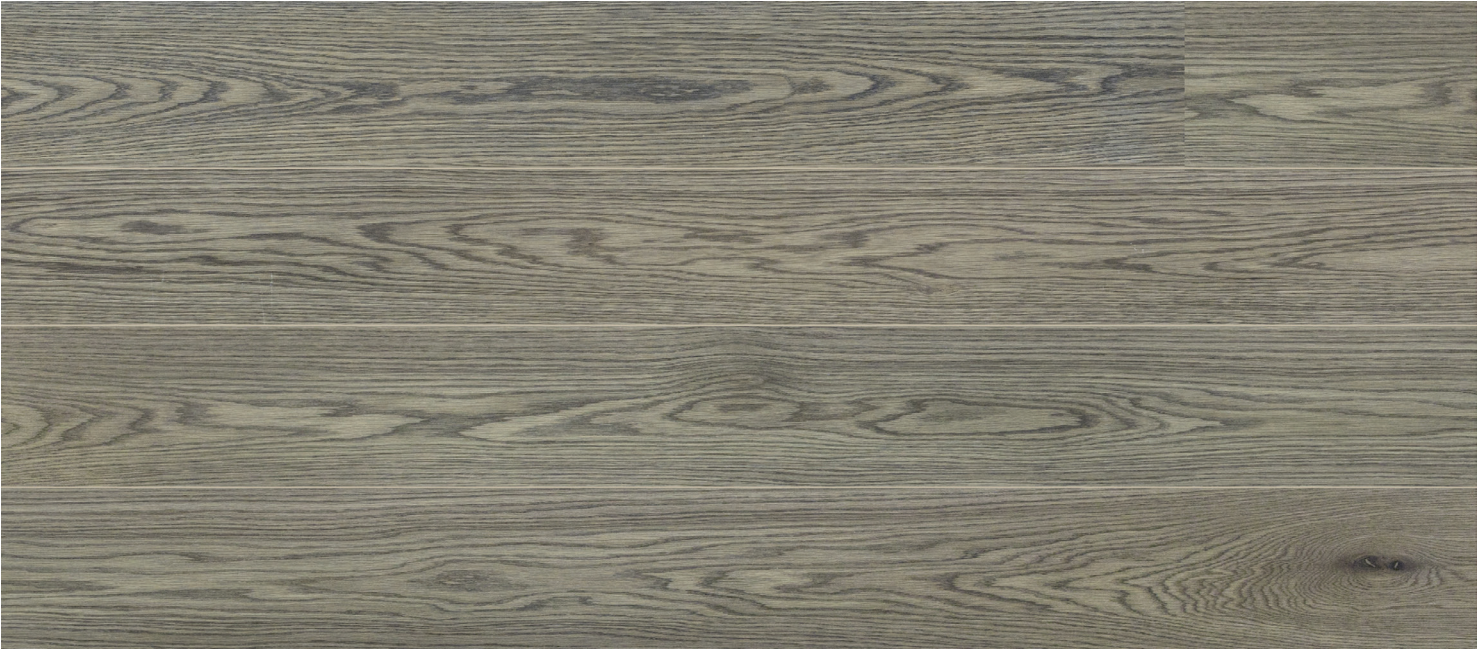
1 Strip US Oak Antique Reactive Stain 2B Pure Line # 5854

Different origin oak will behave differently when treated with reactive stain. The photos show difference between treated European vs. American White Oak.