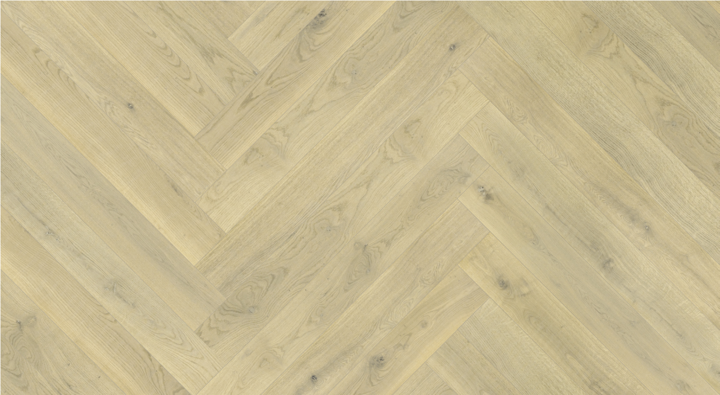
Size Options: 100 x 600 mm 100 x 700 mm 100 x 900 mm 1 lamella Herringbone Pattern Oak Dazy Brush 4B