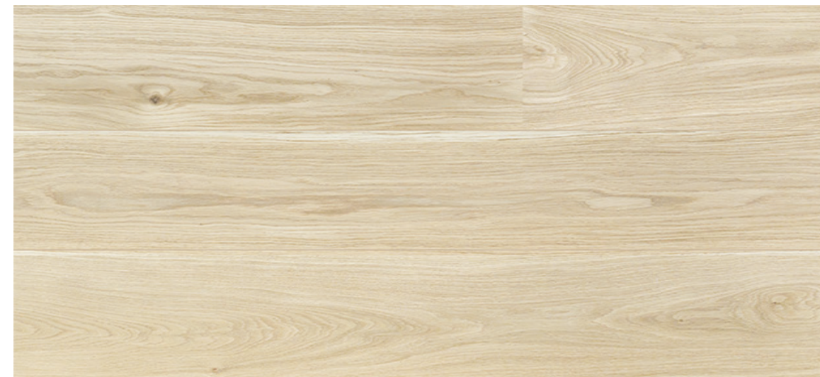
1 Strip 240 mm Wide EU Oak ABC Brush 2B Pure Line #5832

2019 Trend is for pure color and natural surface of the wood. Our new collections represent shades of warm grey and beige colors. The Pure Line Collection brings us color of untreated raw wood in finished parquet flooring. New lacquer surfaces with 5% gloss give the natural oil feeling.