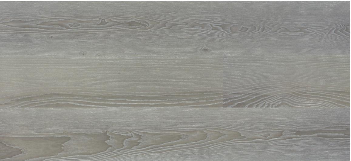
1 Strip Ash Elegant Olive Grey Ivory Pores 2B Extra Matt Lac Gloss 5% #9035