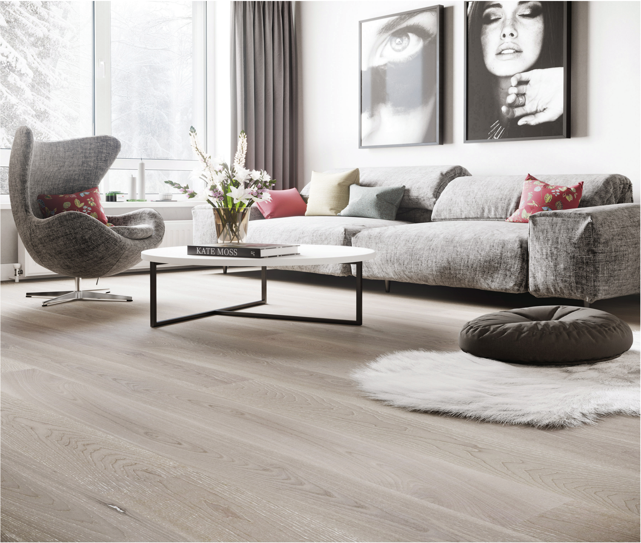
1 Strip Ash Elegant Dune White Pores 2B Extra Matt Lac Gloss 5% #9034