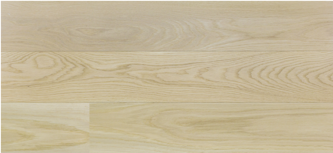
1 Strip Oak AB London 2B Extra Matt Lac Gloss 5% #4043