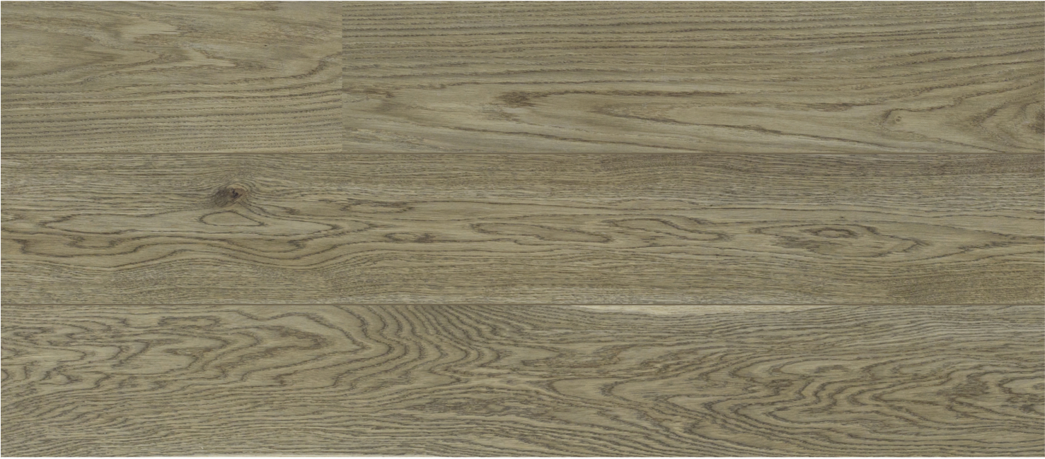
1 Strip EU Oak 240 mm Wide Antique Reactive Stain 2B Pure Line #5461