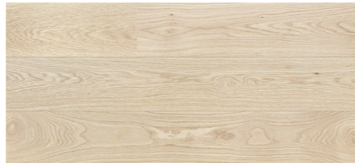
1 Strip 160 mm Wide US Oak AB Brush 2B Pure Line #5828