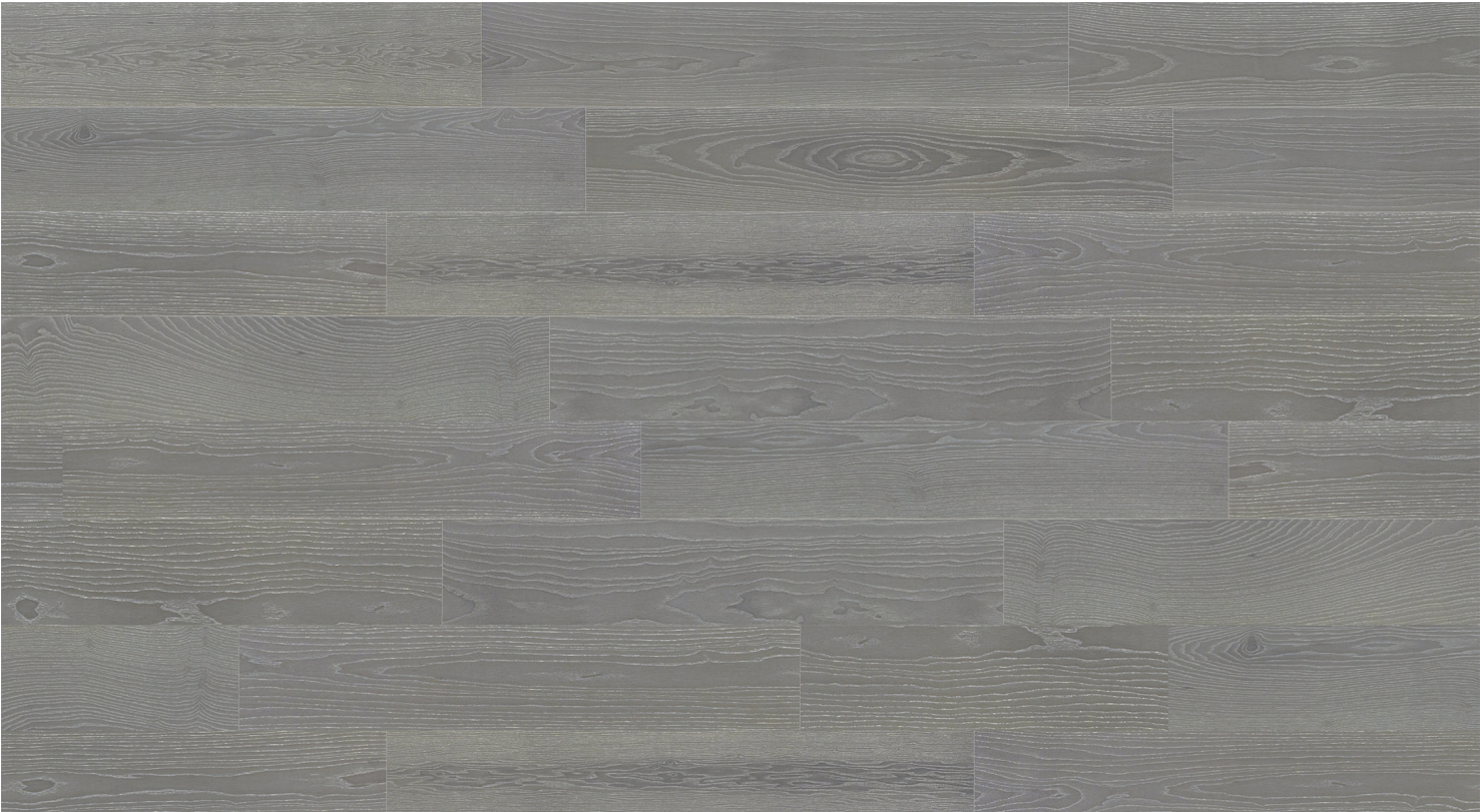
Size Options: 100 x 600 mm 100 x 700 mm 100 x 900 mm Shipdeck Pattern Ash Elegant Dusky Grey White Pores 4B