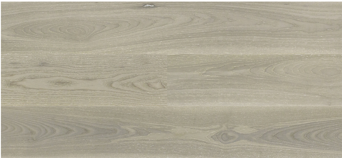
1 Strip Ash Elegant Dune White Pores 2B Extra Matt Lac Gloss 5% #9034