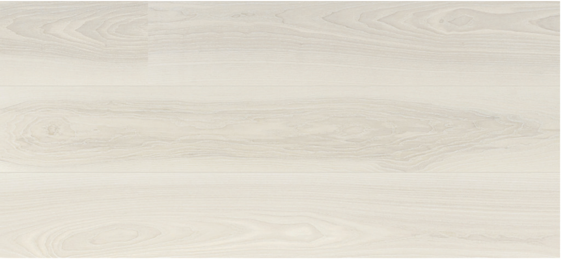
1 Strip Ash Elegant Frost Ivory Pores 2B Extra Matt Lac Gloss 5% #9040