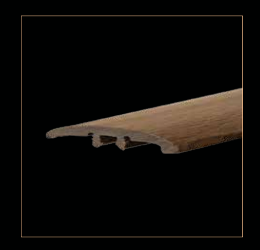
TRANSITION Width: 2" | Length: 94" | Thickness: 1"

All of our mouldings feature the same color treatments as our flooring.