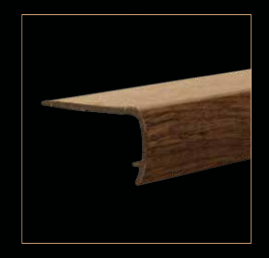
STAIRNOSE Width: 2" | Length: 94" | Thic kness: 1"