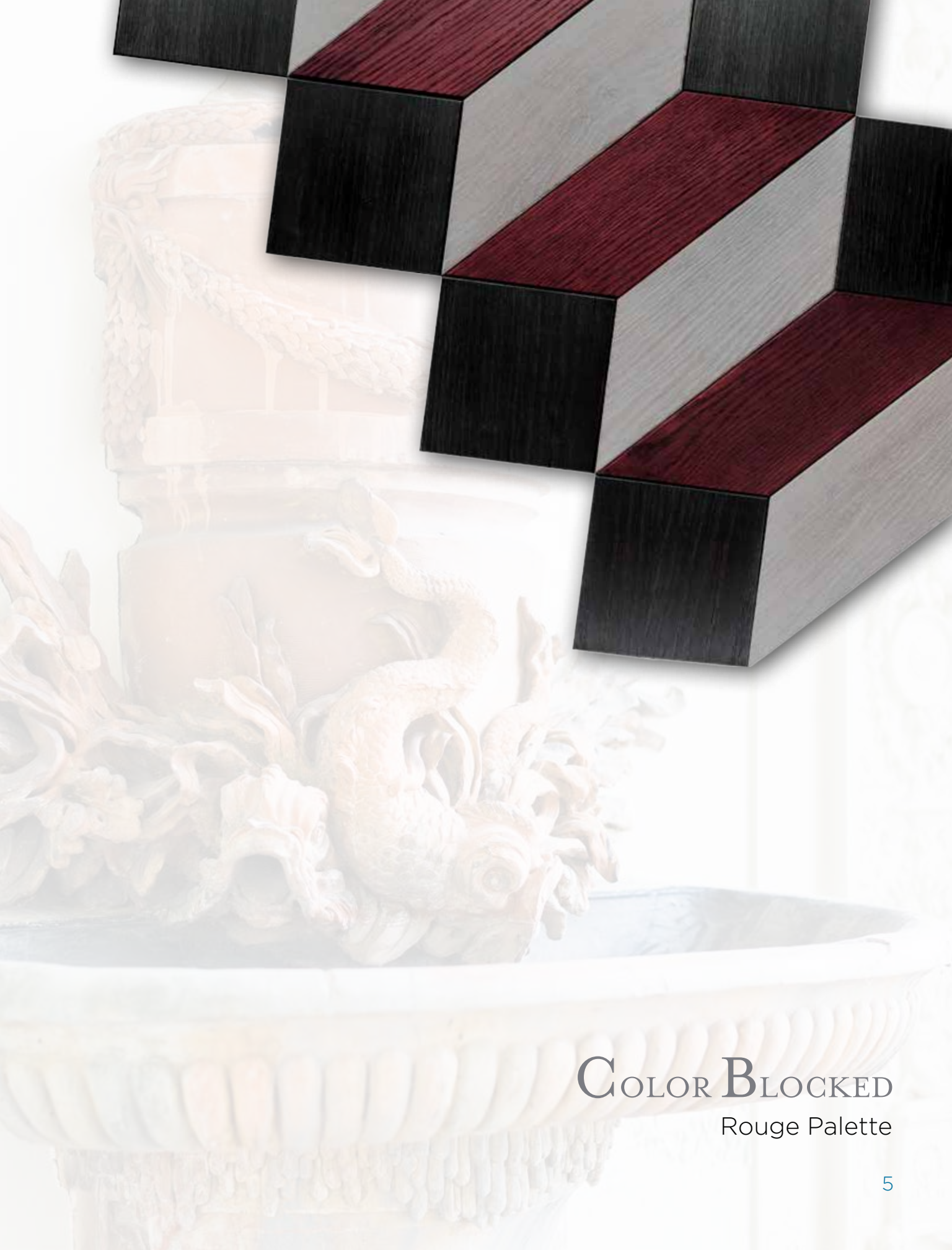
COLOR BLOCKED Rouge Palette