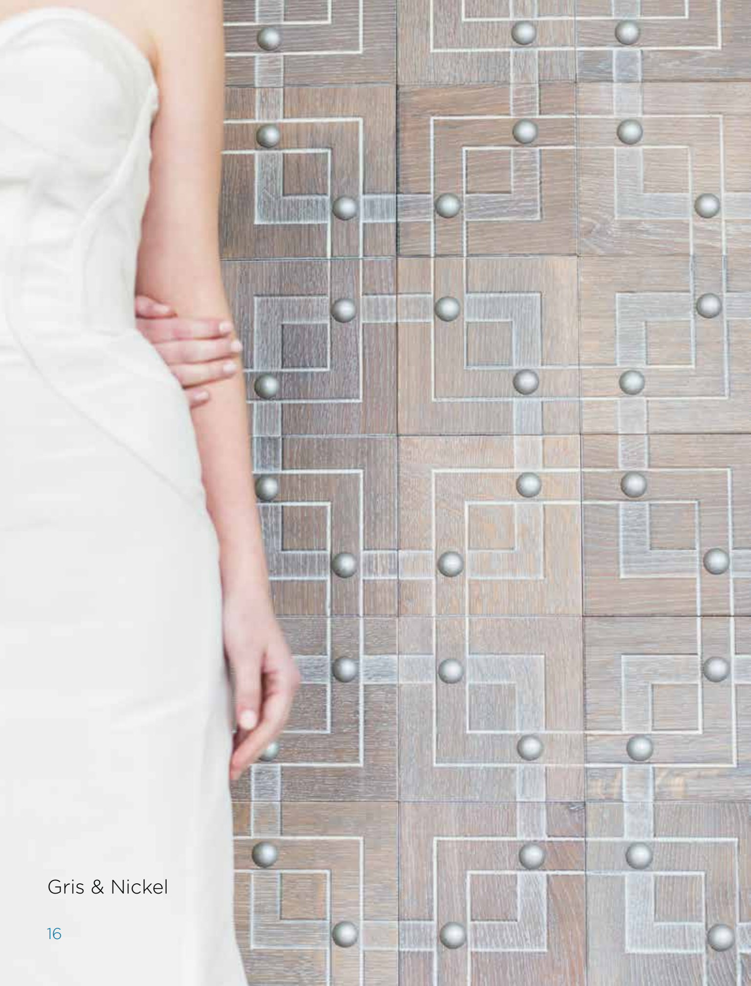
Gris & Nickel