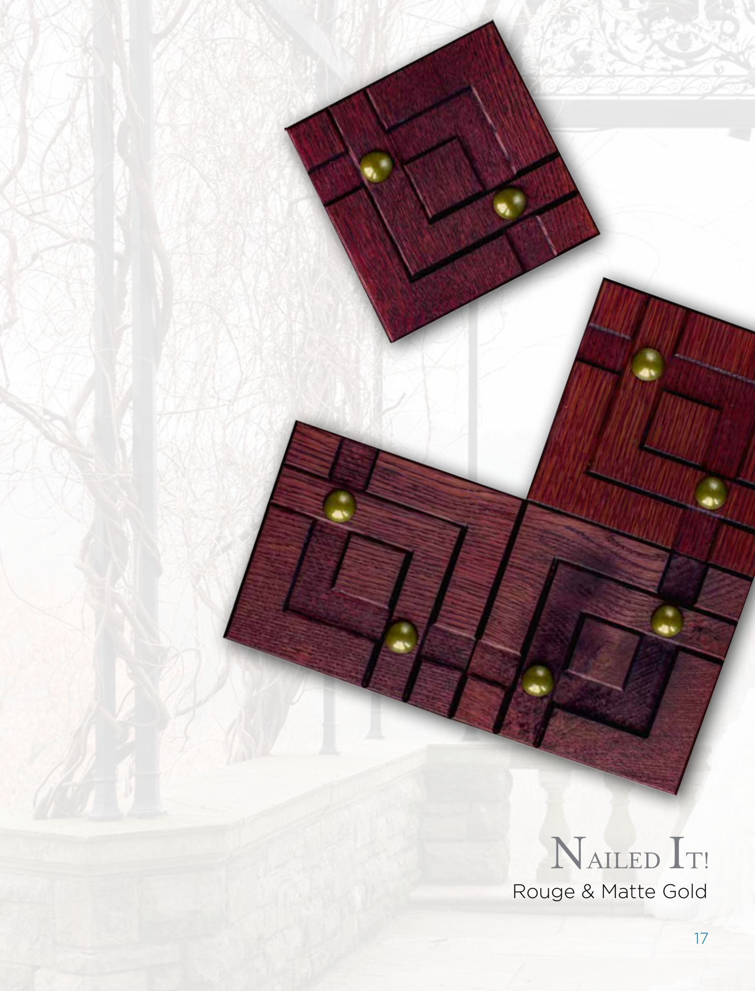
NAILED IT! Rouge & Matte Gold