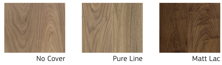
No Cover Pure Line Matt Lac

Walnut is a timeless classic. It was always considered as rich dark color tone. Pure line finish makes it lighter and shows traditional elegance of walnut in a new way. It is a perfect fit for modern interior.